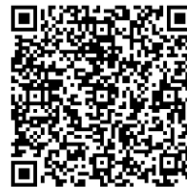
QR Code for download of the Request Form